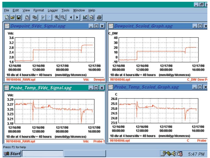
Windows based software provides a variety of graphing options.

other units, while offering outstanding resistance to airborne contaminants and condensation, so you can count on long-term maintenance free monitoring. The Windows based logger software can display temperature graphs in °F or °C, and humidity graphs in %RH or dewpoint units.