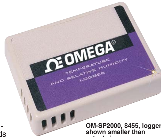
OM-SP2000, $455, logger shown smaller than actual size

Overload Protection: 30 V (reverse polarity protected)