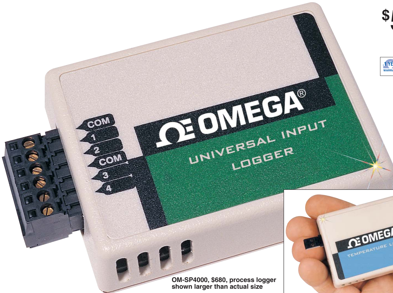
OM-SP4000, $680, process logger shown larger than actual size